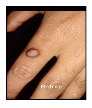
1st VISIT 19/01/2023