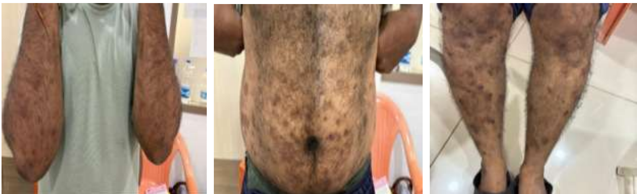
After treatment [ 17/10/25]