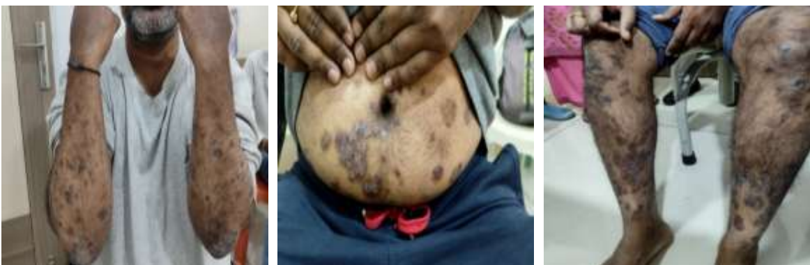
Before treatment [ 17/12/22]