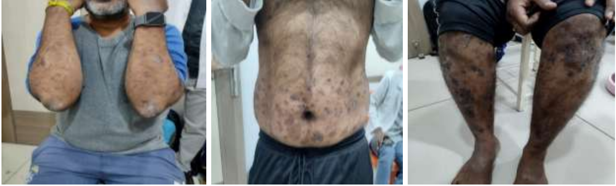
During treatment [ 8/1/25]