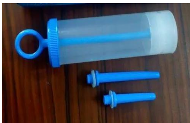
100 Ml syringe for basti karma.

Immune modulator activity, anti-ageing, anti-tumor activity, deobstruent (removes obstruction by widening opening of ducts) hence Ashwagandha formulations ( ashwagandha kwath ) with Ashwagandha tail basti chikitsa is useful.