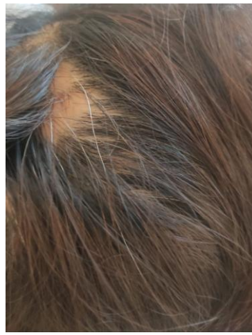
FIG NO. 2 BEFORE TREATMENT