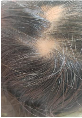
FIG NO. 1 BEFORE TREATMENT