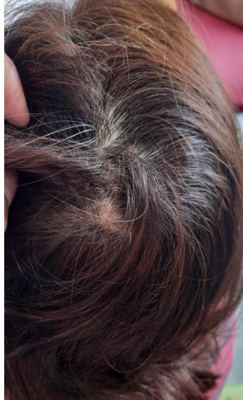
FIG NO. 5 AFTER TREATMENT