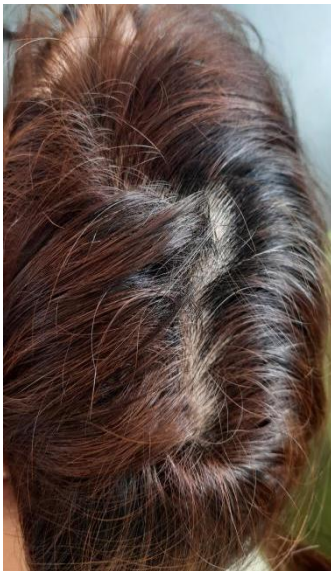
FIG NO. 4 AFTER TREATMENT