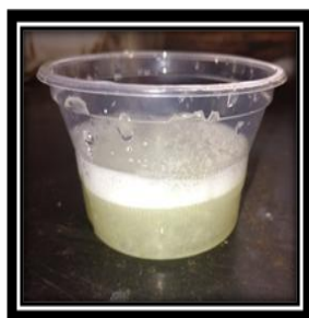
FIGURE NO. 1.4 VANGA MARANA