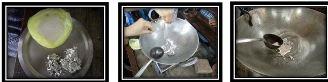
Stirring Of Vanga with Apamarga Panchanga Churna