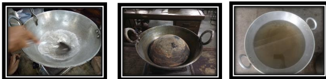
Teevragni for 1 Hr. Prakshalana