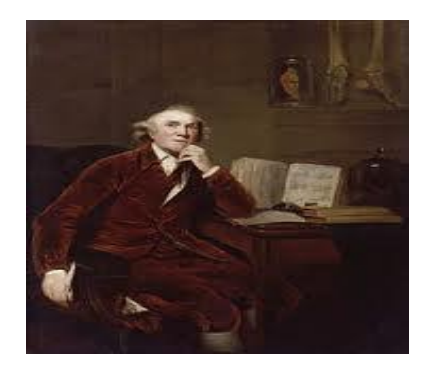
Figure 5 (Portrait by John Jackson - National Portrait Gallery)