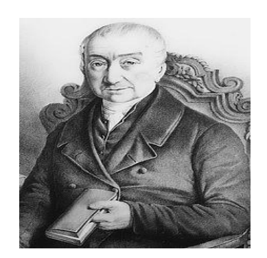
Figure 12 (Source- http://www.rheinischegeschichte.lvr.de/persoenlichkeiten/R/Seiten/JohannGottfriedRademacher.aspx)

Rademacher was German customary doctor who changed over to homeopathy to end up the cutting edge father of Organopathy. Rademacher was a contemporary of Samuel Hahnemann. Rademacher's little book Rademacher's Universal and Organ Remedies is a standby for present day homeopaths today. James Compton Burnett was an awesome fanatic of Rademacher and Organopathy.