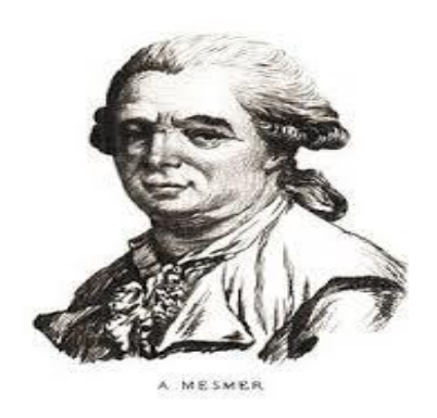
Figure 7 ([http://en.wikipedia.org/wiki/Image:Franz_Anton_Mesmer)

Mesmer's asserted revelation of another aetherial liquid, creature attraction, which, he battled, penetrated the universe and the groups of every single energize being and whose legitimate adjust was essential to well being and ailment. Creature attraction was yet one of arrangement of hypothesized unpretentious liquids and substances, for example, caloric, phlogiston (a speculative substance display in all materials and discharged amid copying), attraction, and power, which at that point suffused the logical writing. It additionally mirrored Mesmer's doctoral proposal, De Planatarum Influxu ("On the Influence of the Planets"), which had explored the effect of the gravitational impact of planetary developments on liquid filled substantial tissues. His attention on attraction and the helpful capability of magnets was gotten from his perusing of Paracelsus and Johannes Baptista van Helmont.