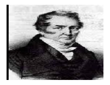
Figure 11

Broussais was French doctor who advocated bleeding, leech treatments, and fasting commanded Parisian restorative practice right on time in the nineteenth century. Following production of L'Examen des regulations médicales (1816; "The Examination of Medical Doctrines"), Broussais' arrangement of "physiological solution" quickly turned into the most prominent restorative theory around Paris. His convention demanded that all ailment begins as an aggravation of the gastrointestinal tract that goes to different organs "thoughtfully." Broussais is one of history's