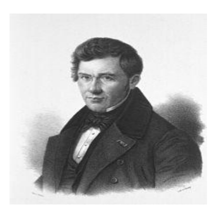
Figure 13

Hecker was German doctor and therapeutic author, whose works show up in encyclopedia and journals. He especially examined ailment in connection to mankind's history, including plague, smallpox, baby mortality, moving madness and the sweating affliction, and is regularly said to have established the investigation of the historical backdrop of sickness<sup>vii</sup>. Hahnemann said in supplement para 119 of Para 82<sup>1,3,6</sup> of Introduction, "Hecker utilized different restorative mixes effectively for a situation of caries happening after smallpox. Luckily every one of these blends contain Mercury, to which it might be envisioned that this illness will yield (homoeopathically)".