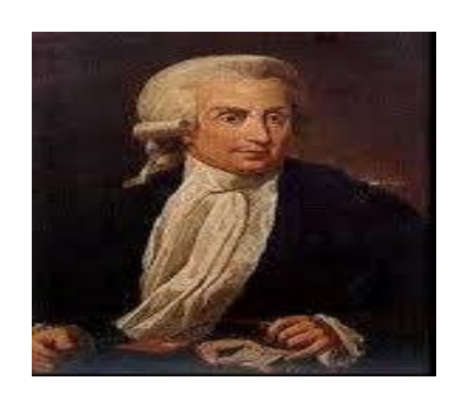
Figure 9

Italian doctor, physicist and thinker who had likewise considered pharmaceutical and had polished as a specialist, lived and died in Bologna. In 1771, he found that the muscles of dead frog's legs jerked when struck by a spark. This was one of the main raids into the investigation of bioelectricity, a field that still today examines the electrical examples and signs of the sensory system. The perception made Galvani the main specialist to value the connection amongst power and movement — or life. This finding gave the premise to the new understanding that the stimulus behind muscle development was electrical vitality conveyed by a fluid (particles), and not air or liquid.