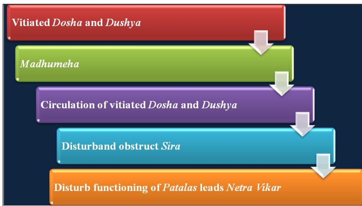
Figure 1: Major pathological events of Madhumehajanit Netra Roga

Ayurveda Sushrutacharya described consequences of Netra sharira associated with Patala of Netra . Externally eye is covered under two Patala ( Urdhva and Adho Vartma ) while four internal Patala . The Vatavaha , Raktavaha , Kaphvaha and Pittavaha Sira greatly involves in functioning of Netra along with Patala 6,7 . The pathogenesis of Madhumehajanit Netra Roga involves disturbances in Sira and Patala as depicted in Figure 1 .